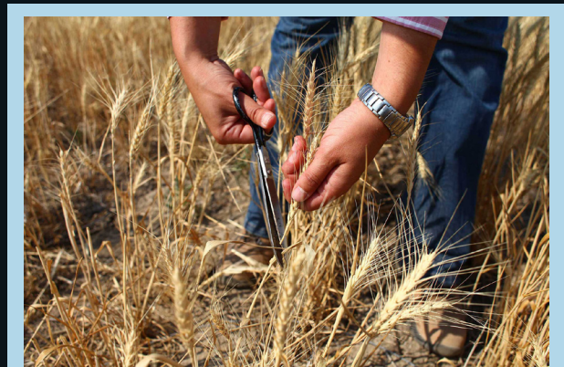
Montana agricultural ecosystems provide food for the U.S.