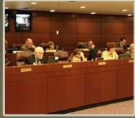
Policy, Decision Making, Outreach