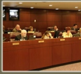
Policy, Decision Making, Outreach